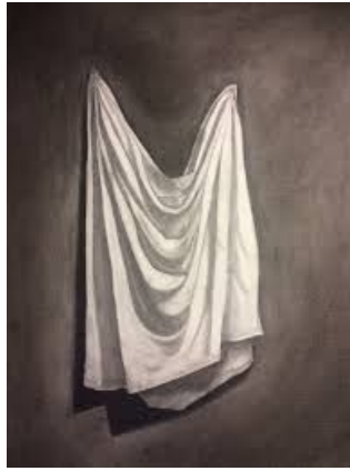
Study From Life